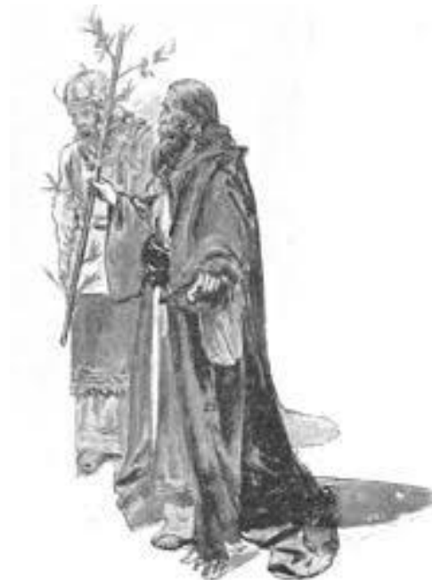
“The rod of Aaron was budded.”— Num. xvii. 8.