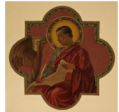
Depiction of St John in the Catholic Indian Church

You search the Scriptures, for in them you think you have eternal life...But you are not willing to come to Me that you may have life’ John 5:39-40