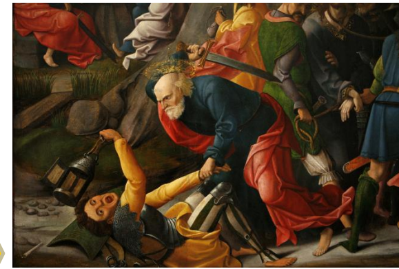
Depiction of St Peter cutting Malachus' ear. Christ is being arrested in the background

'I do not pray for these alone, but also for those who will believe in Me through their word' John 17:20