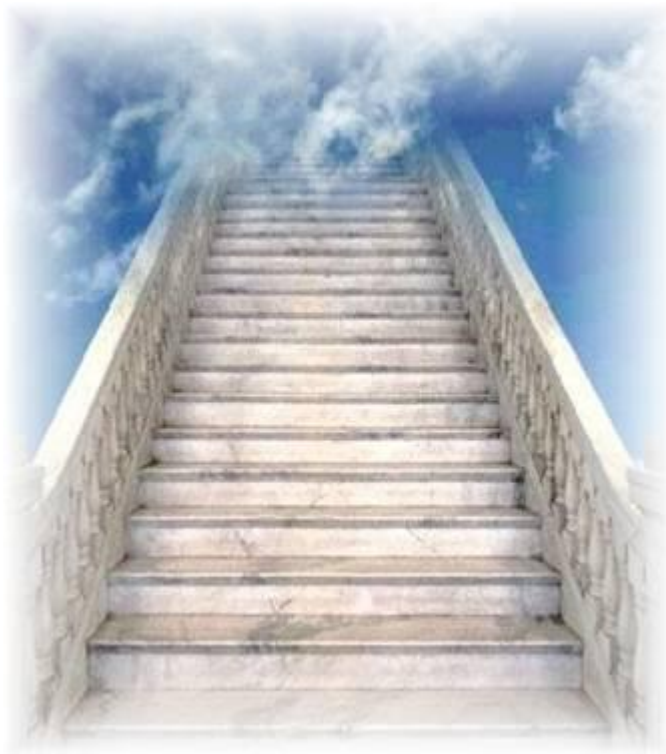
Eternal torment – Path to heaven