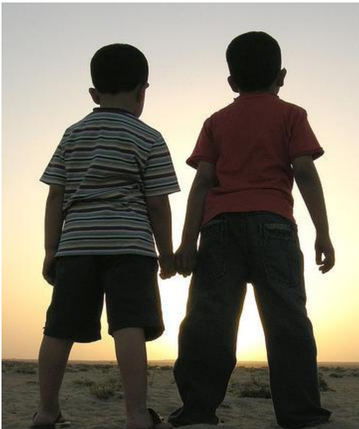
Loneliness – Friendship