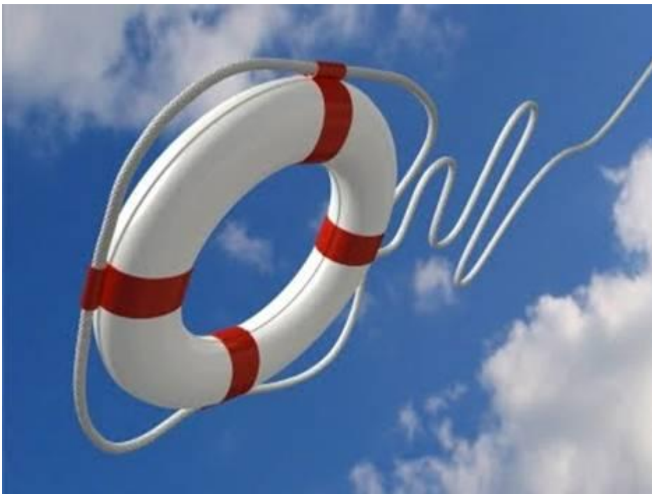
Drowning – Lifesaver