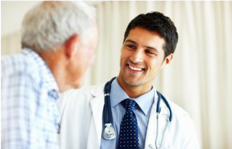
Terminal disease – Doctor