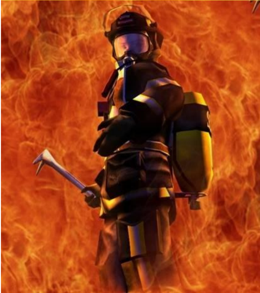
Fire – Firefighter