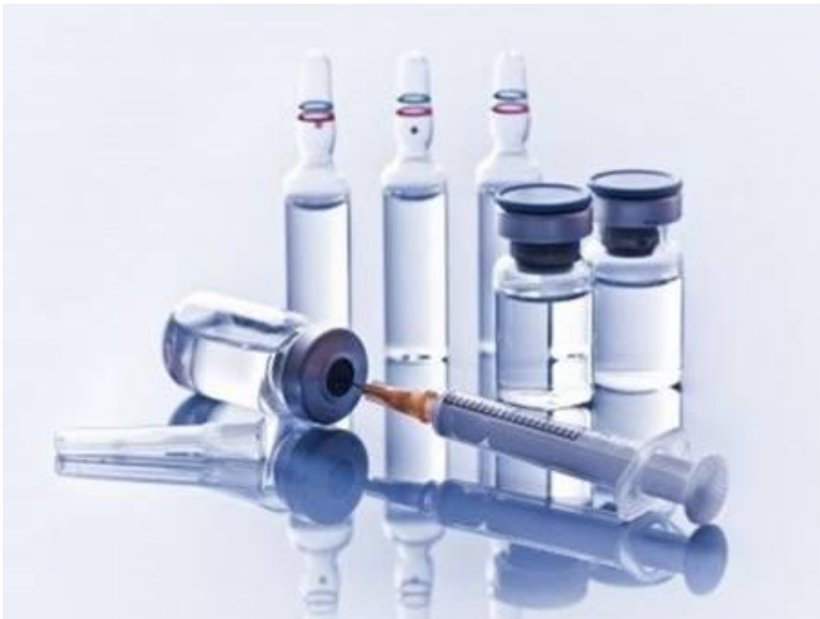
Spider – Anti-venom