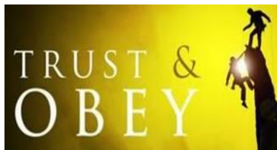
Yr 8 & 9 Bible Study: 1 Samuel 18-19