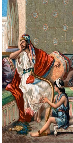
Yr 8 & 9 Bible Study: 1 Samuel 16-17