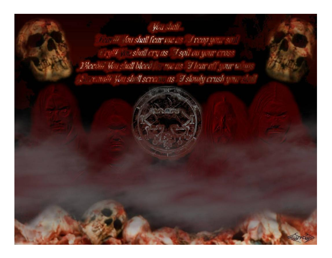
http://www.joyofsatan.com/Satanic_Music.html http://www.rapidnet.com/~jbeard/bdm/Psychology/rockm/satanic.htm http://findarticles.com/p/articles/mi_m2248/is_134_34/ai_55884913/pg_1